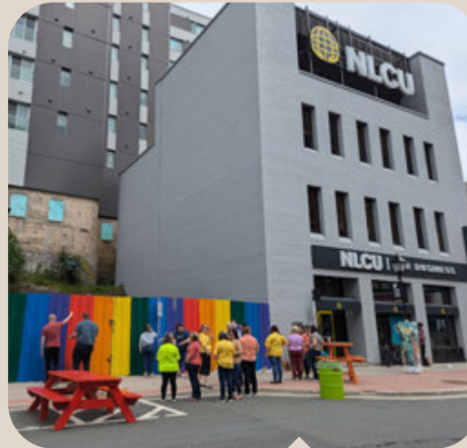
Refreshing the Rainbow Fence at 240 Water Street.