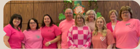
Pink Shirt Day at the Grand Falls-Windsor Branch.